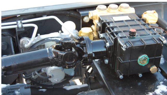
UHPS PTO pump