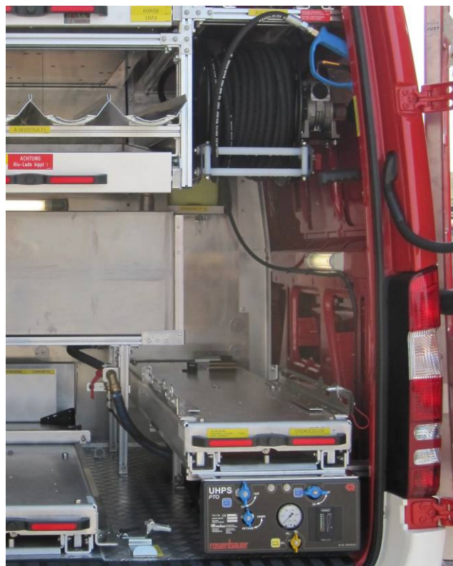
UHPS PTO control panel in vehicle