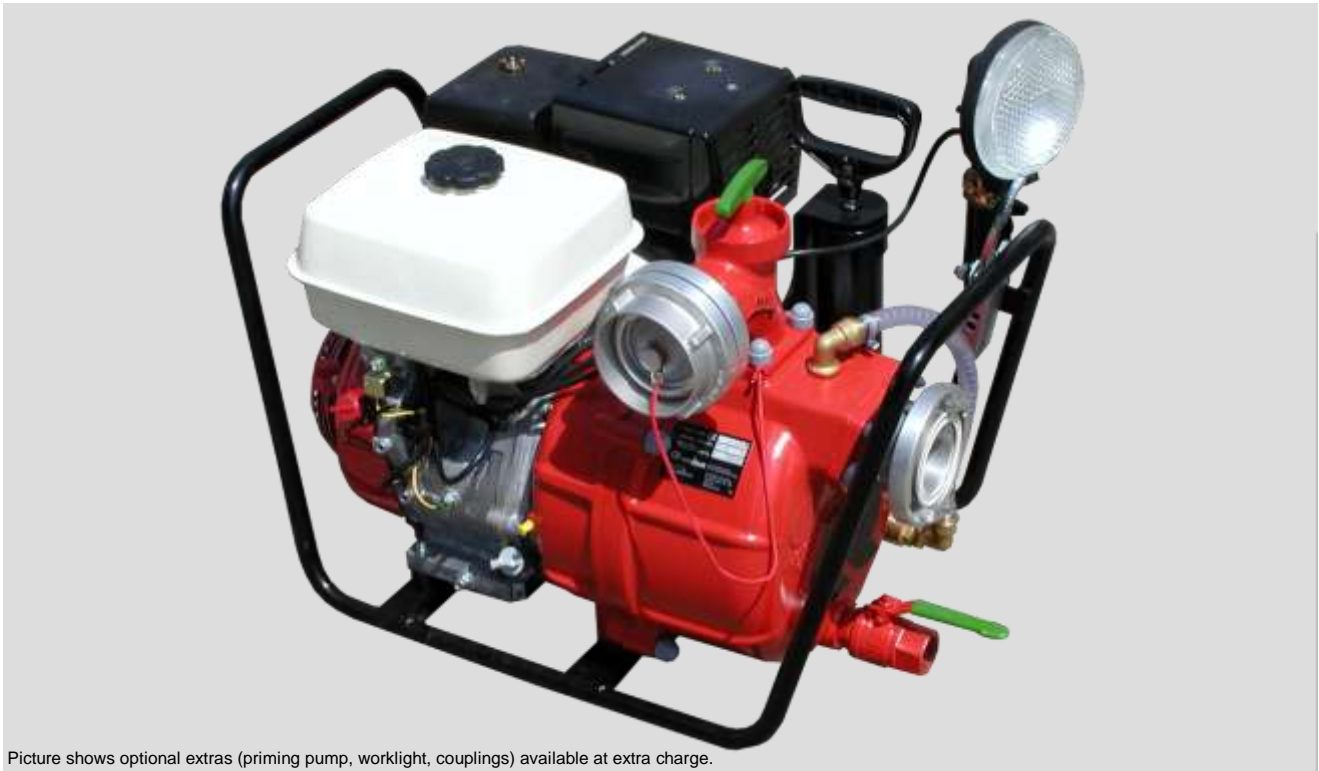
Picture shows optional extras (priming pump, worklight, couplings) available at extra charge.