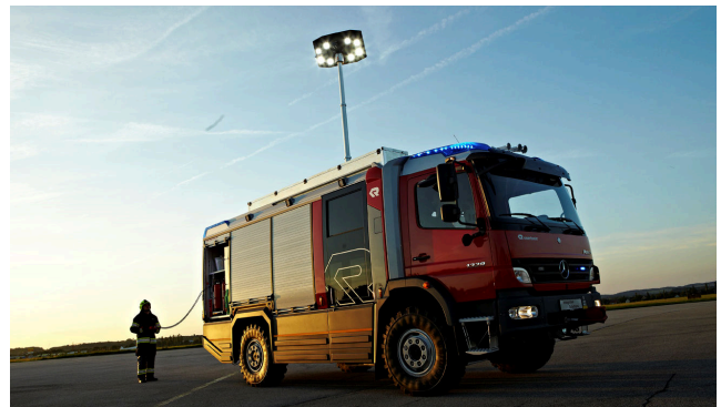
FLEXILIGHT LED in municipal vehicle AT