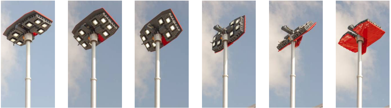
Stepless tilting of head (0° to 180°)